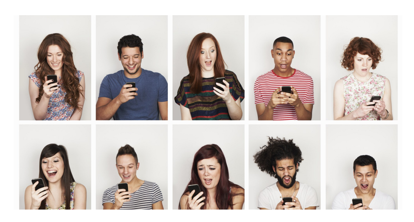
Stay connected to the UNA Center for Women's Studies by following us on social media: